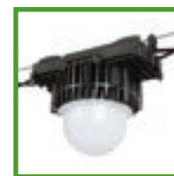
ALIS Barn Lamp