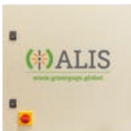
ALIS Power Hub Panel

Warranty valid from date of manufacture.