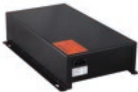
ALIS Power Hub 500W 1-Channel (230V) Order No: IPH500230