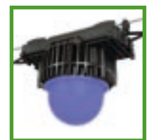
ALIS Blue Lamp