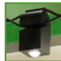
ALIS Nest Lamp